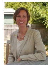
By Sigrid Reymond