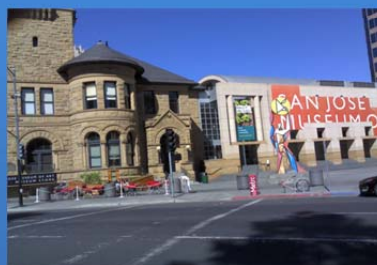
San Jose Museum of Art/ Walking distance of CLEC